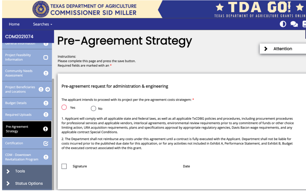
Figure 1. Pre-Agreement Strategy signature page

The grant application includes an opportunity to request approval to utilize the pre-agreement strategy in order to pursue early implementation of the project. TDA will notify the Grant Recipient if, in its sole discretion, the agency declines the pre-agreement request. Fund specific requirements and restrictions on the type of activities eligible as pre-agreement costs are addressed in each fund's Application Guide.