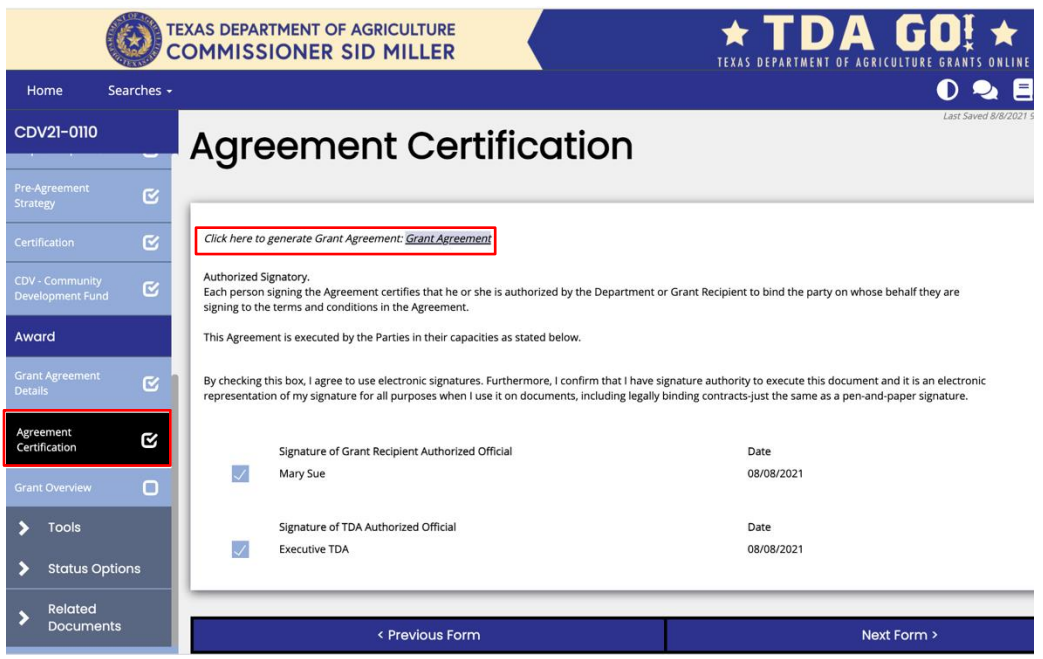
Figure 2. How to view your grant

The chief local official for the Grant Recipient or other local official, designated by resolution and registered in TDA-GO as the Authorized Official (AO), and the authorized TDA designee must both execute the Grant Agreement in TDA-GO before it is considered fully executed.